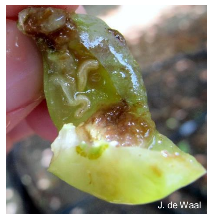
Medfly larvae feeding in a grape.