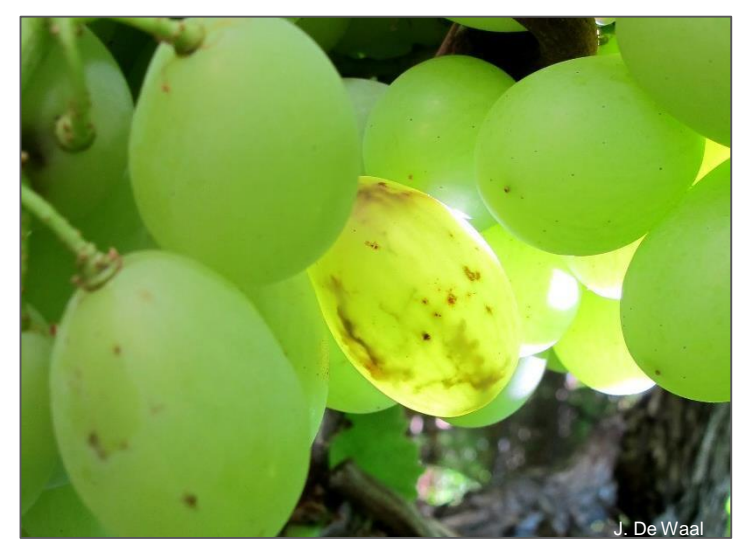
Medfly oviposition damage to a grape.

In SIT, male pupae are irradiated to render them sexually sterile. Adult males which emerge from irradiated pupae are released from airplanes to mate with wild females. No fertile eggs are produced from this encounter, rendering the fruit fly population smaller in the next generation, although adult wild females may still cause probing damage.