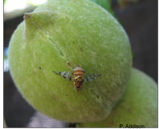
Medfly on an unripe peach.