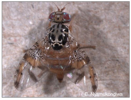
Medfly adult female.