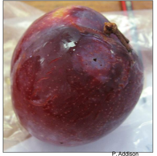
Medfly oviposition damage on a plum.